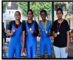
BOYS and Women Wrestling Free style