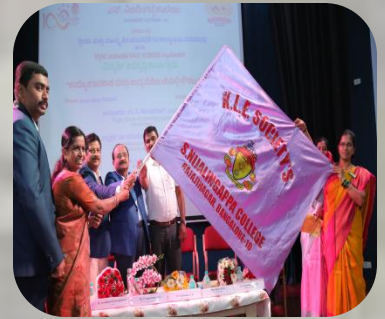
Handing over the flag to start the sports and cultural activities