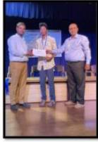
BCU Boys Taekwondo