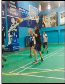
BCU Womens Basketball