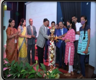
Inauguration of sdp by lighting lamp

Chairman, Karnataka Border Area Development Authority, Government of Karnataka. The Chief Guest inaugurated SDP by lighting lamp and handed over the flag to the vice presidents of both Sports and Cultural forums to symbolize the start to the activities, KLE Bulletin was also released.