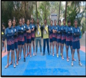
BCU Womens Kabaddi team