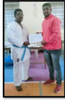
BCU Karate championships