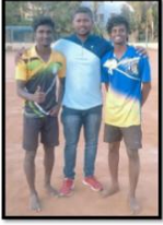
BCU Boys KHO-KHO