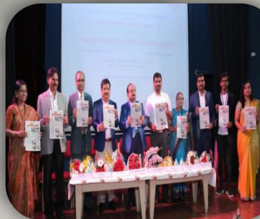
Releasing of KLE Bulletin by Honourable chief guest