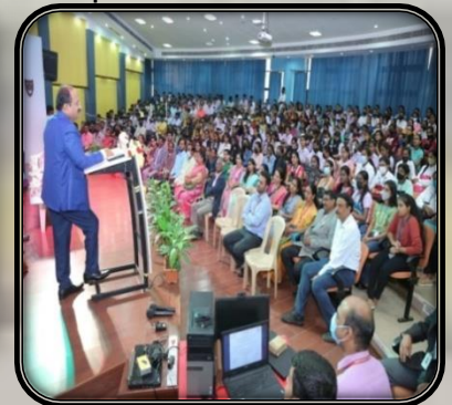
Speech by Chief guest