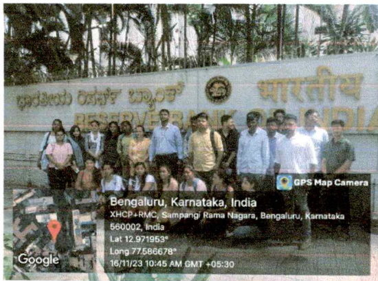
Entrance of RBI Bangalore