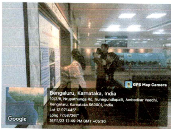
Student's observation of RBI Functions