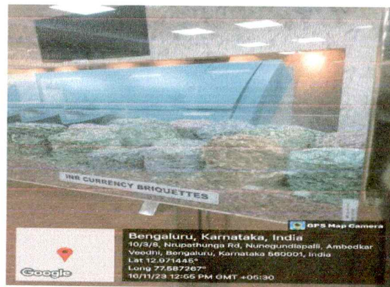
Currency Notes Disposed