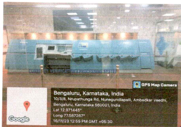
Currency Notes Disposal Machine