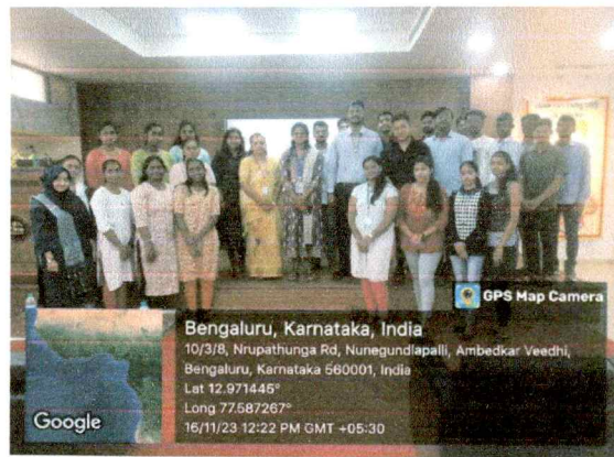
Group photo with RBI Recourse Person