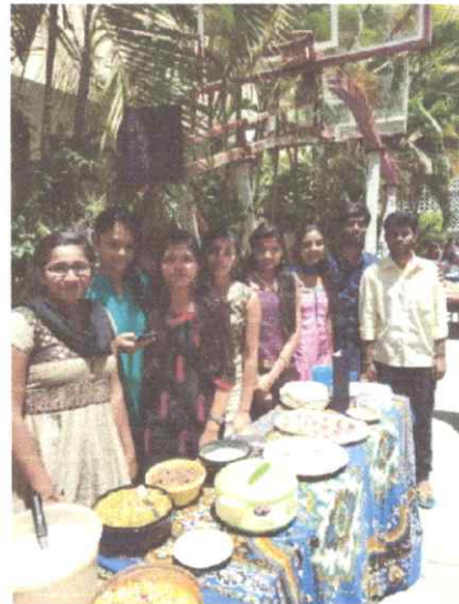
Students participating in the program with their food prepared.