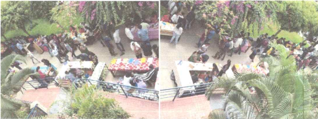
An over view of the Nutrition day.