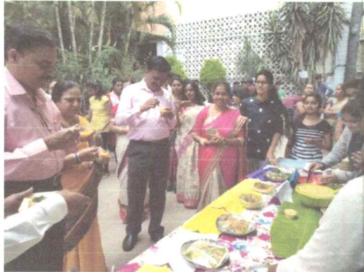
Principal encouraging the students.