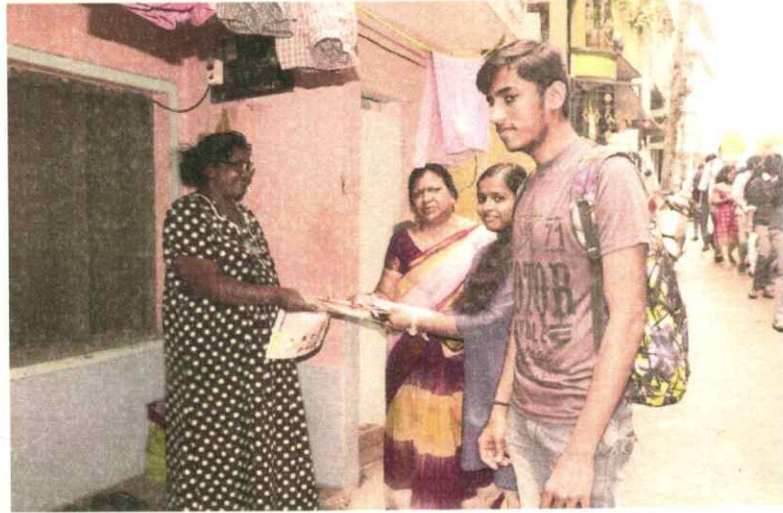
Creating awareness to the public by distributing pamphlets.