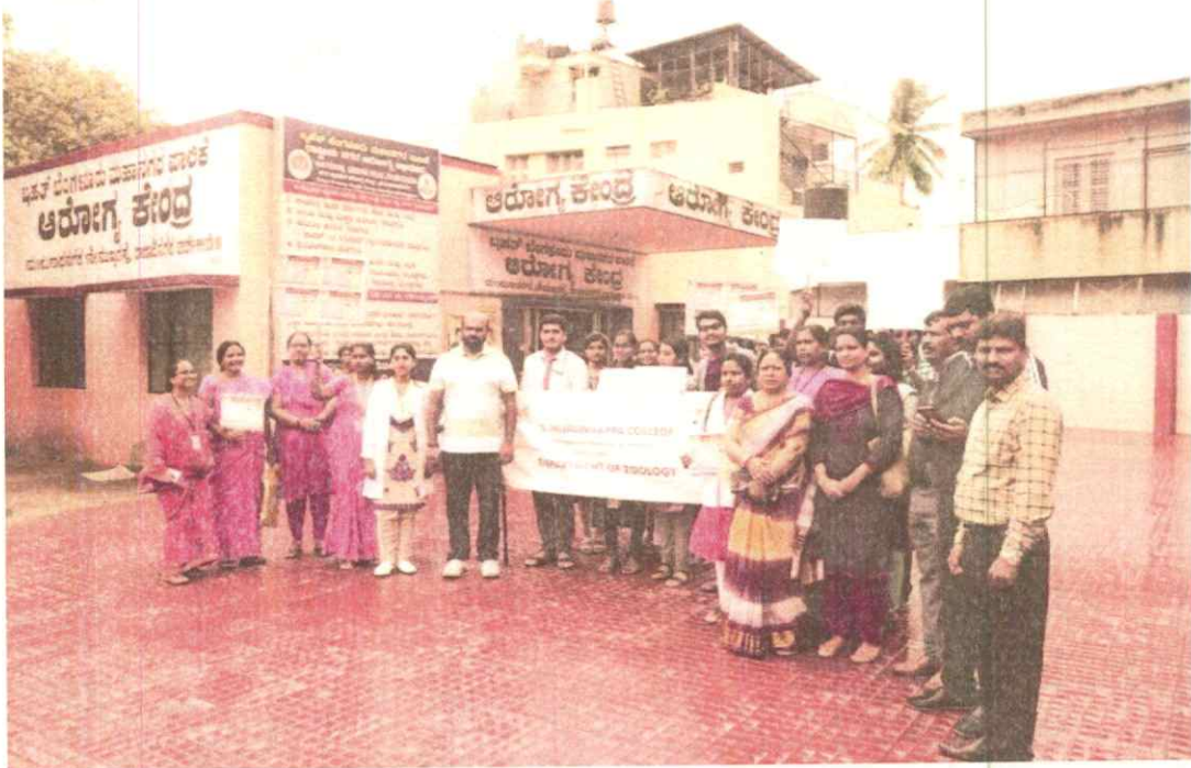
Initiation of rally along with corporator from Primary Healthcare Center, Manjunath nagar.