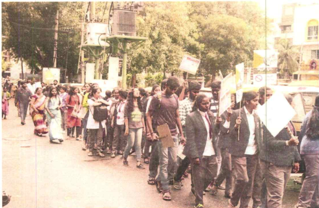
Student's involvement in rally