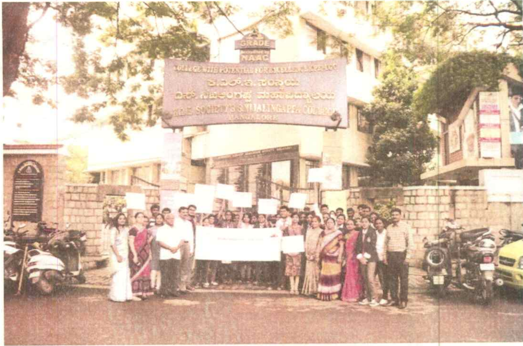
Starting point of rally