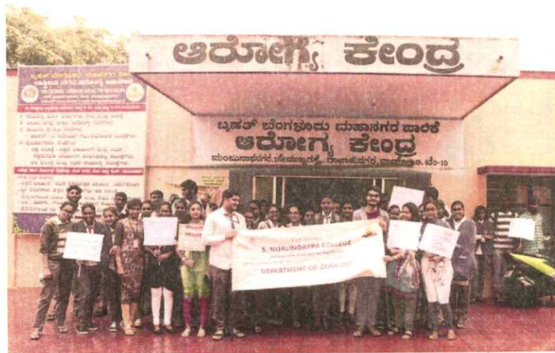
After completion of rally assembled at Health Care Centre