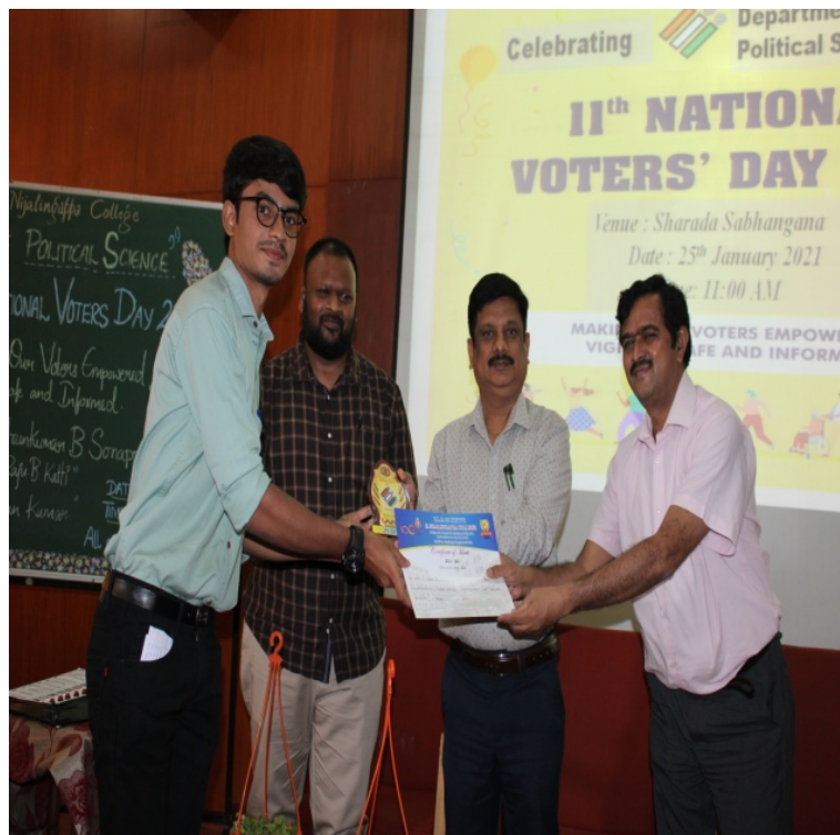
Slogan writing competition prize distribution