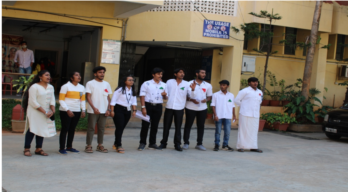
Voting awareness street play by the students