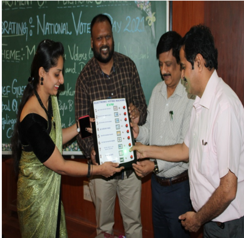
Students made working EVM model