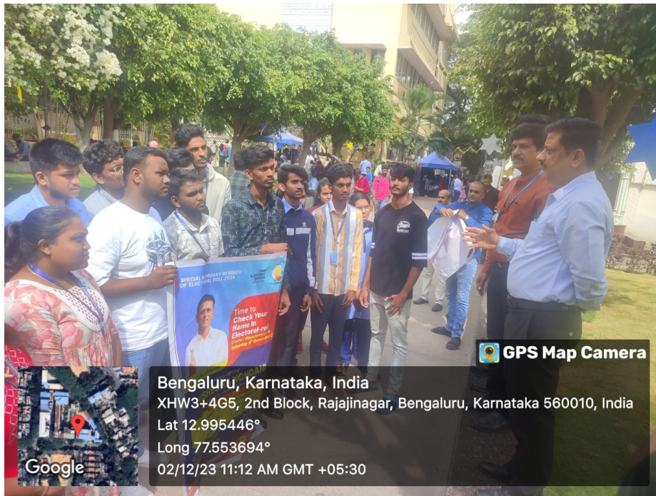
Voter ID Registration Drive