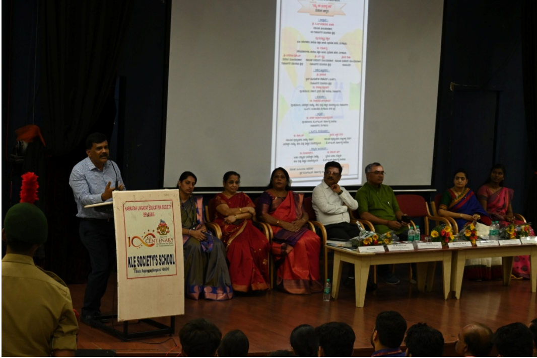
"ನಮ್ಮ ನಡೆ ಮತಗಟ್ಟೆ ಕಡೆ" ಜಾಗೃತಿ ಅಭಿಯಾನ ಕಾರ್ಯಕ್ರಮ