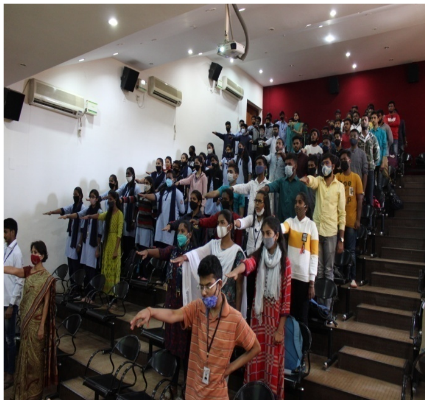
Oath taking in the National Voters Day