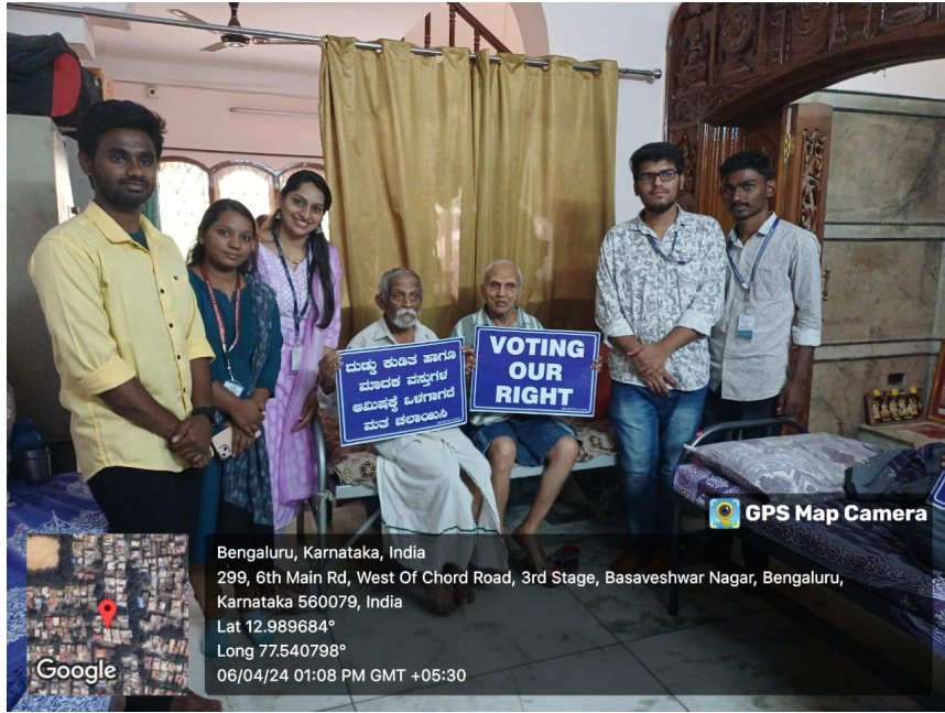
Voter Awareness Campaign at old age home