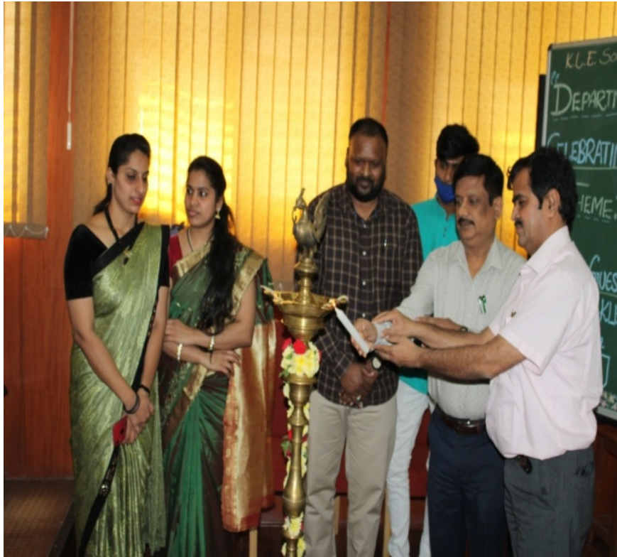
National Voters Day Celebration